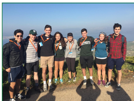
18s in Israel on Chabads 9th Trip

During the Winter Term, Chabad at Dartmouth has been hard at work establishing an infrastructure for its newest addition to Jewish Student Life. Career Conversations @ Chabad seeks to facilitate the