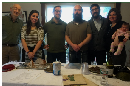
First at Chabad, redemption of the first born