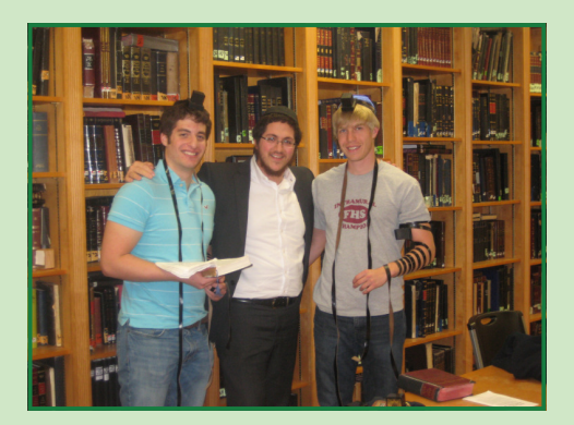
Sinai Scholars in Montreal laying Tefillin