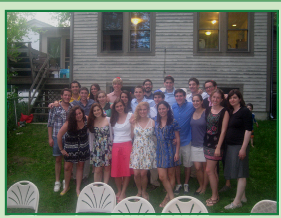
6th Graduating class of Sinai Scholars at Dartmouth.