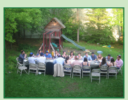
Dinner at Chabad, enjoying the good weather