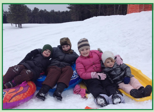
Gray Family Sledding Team