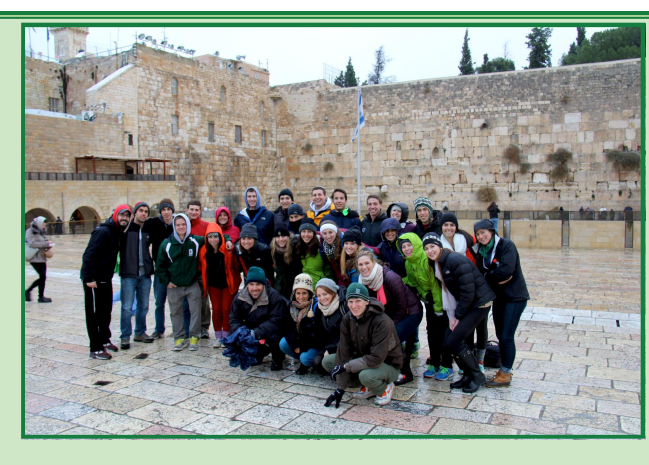
Cold and Wet Group Photo at The Wall