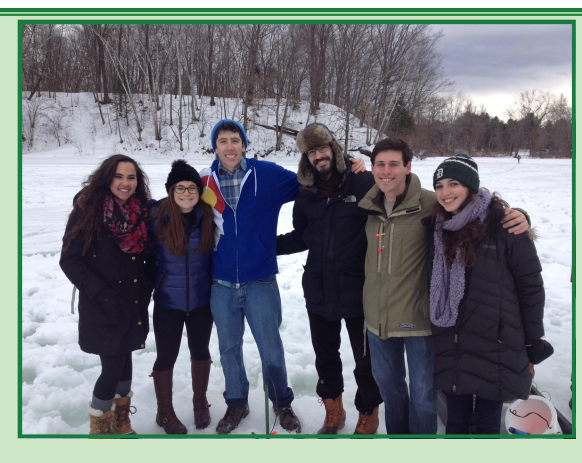
Finally after 10 winters, Ice Fishing