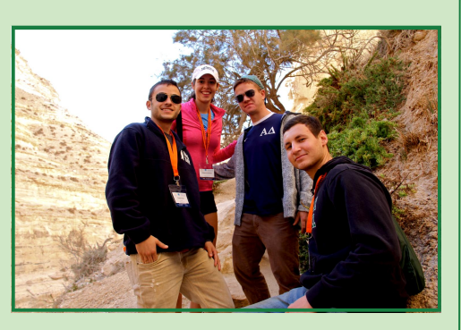
Cool even with the orange name tags