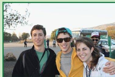
All smiles in Israel