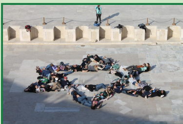
Human Star at Caesarea