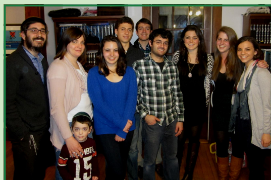
Some of the seniors at the Senior Class gift celebration