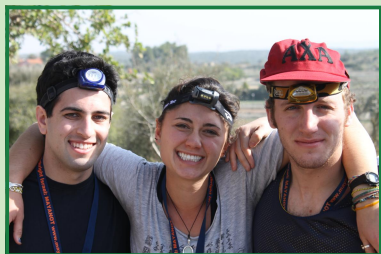
Moments before Cave Diving