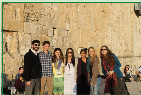
Bar and Bat Mitzvahs at the Southern Wall