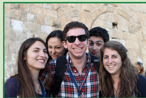
A lighter moment on our trip