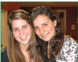
Chabad and Hillel Presidents