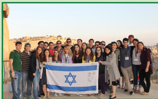
The 26 Dartmouth Students who went on BRI